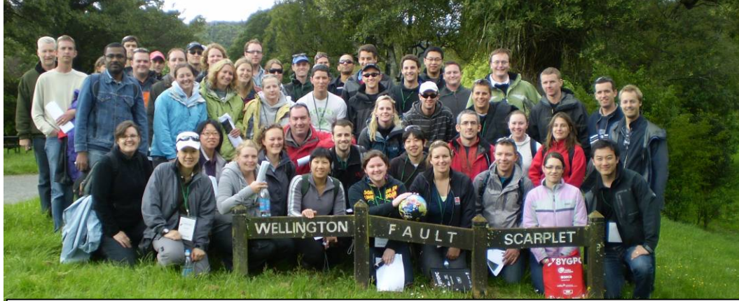
The 8YGPC gang on the Wellington Fault Scarp