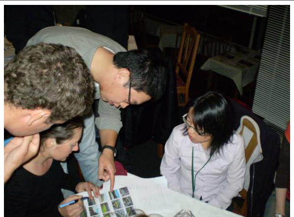
A team hard at work during the conference dinner quiz.