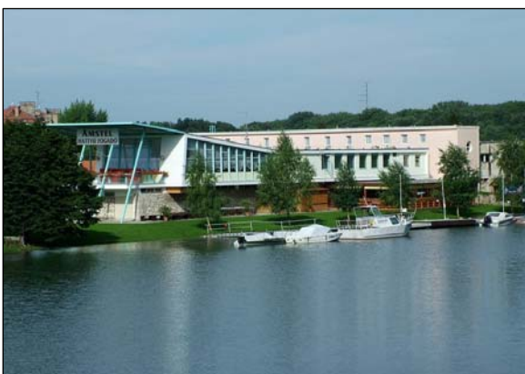
Site of the Thursday dinner