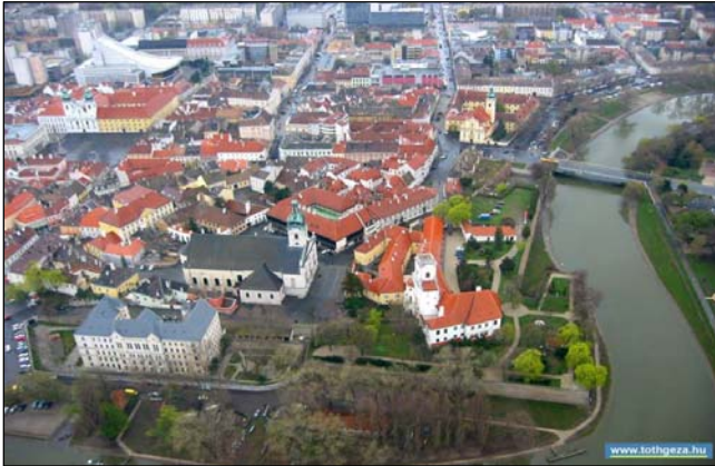
Aerial view of the downtown