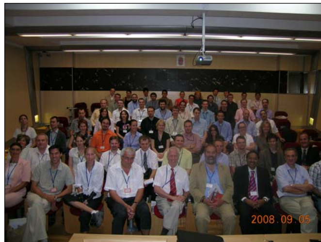
Participants in the lecture hall, Széchenyi István University