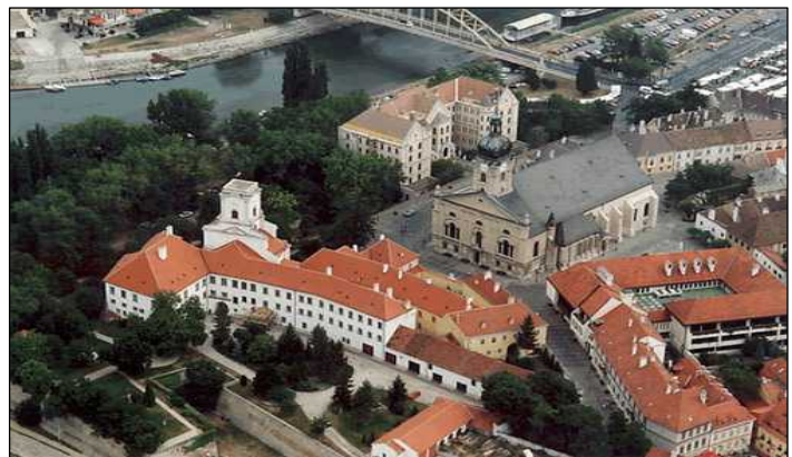
Bishop's palace and Cathedral