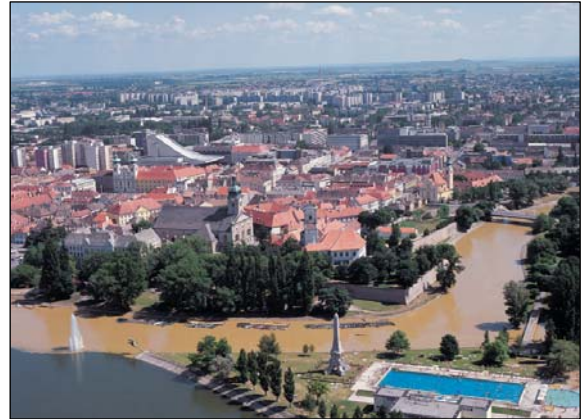
Aerial view of Győr