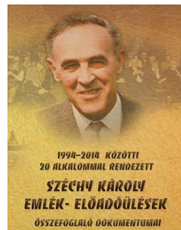
Fig.3 Cover page of the book