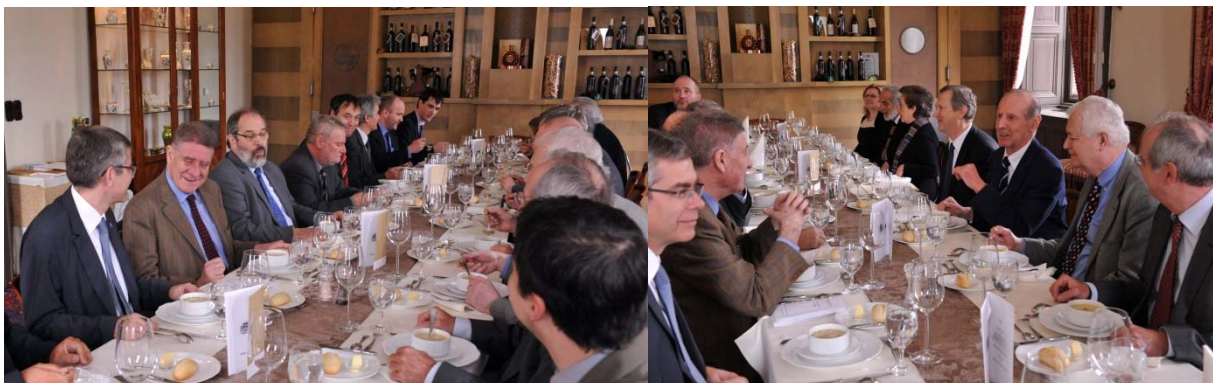
Fig. 2 "Working lunch" at the Club of the Hungarian Academy of Sciences before the Széchy Memorial Lectures