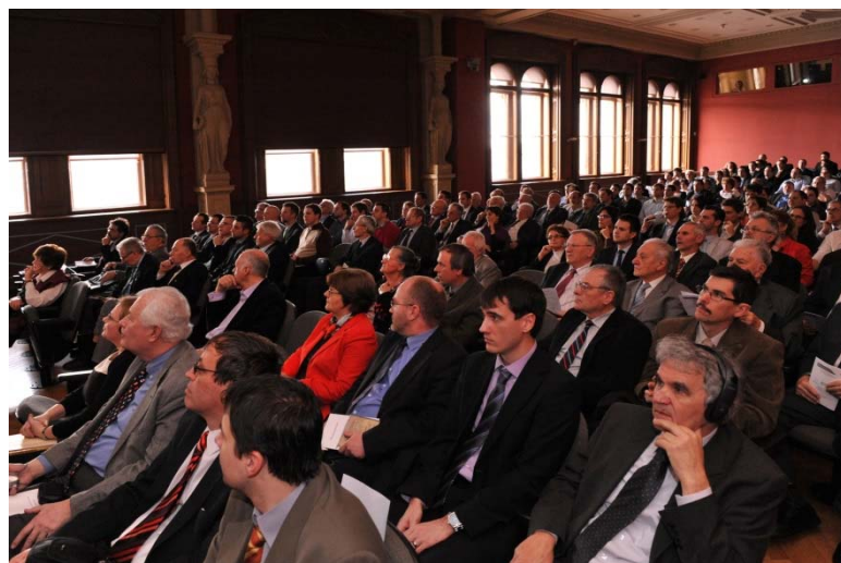
Fig. 5 The audience at the memorial meeting