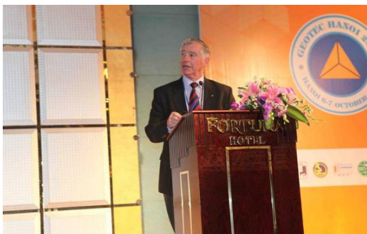
Figure 07. Keynote lecture by Prof. Harry Poulos (Australia).