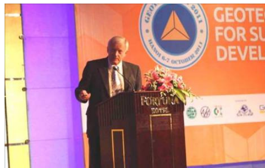
Figure 08. Keynote lecture by Prof. Pieter Vermeer (Netherlands).