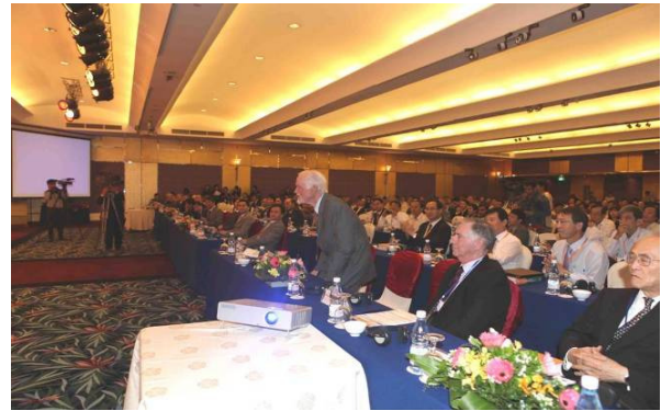
Figure 04. Part view of the audience.