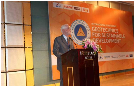
Figure 05. Keynote lecture by Prof. Sven Hansbo (Sweden).