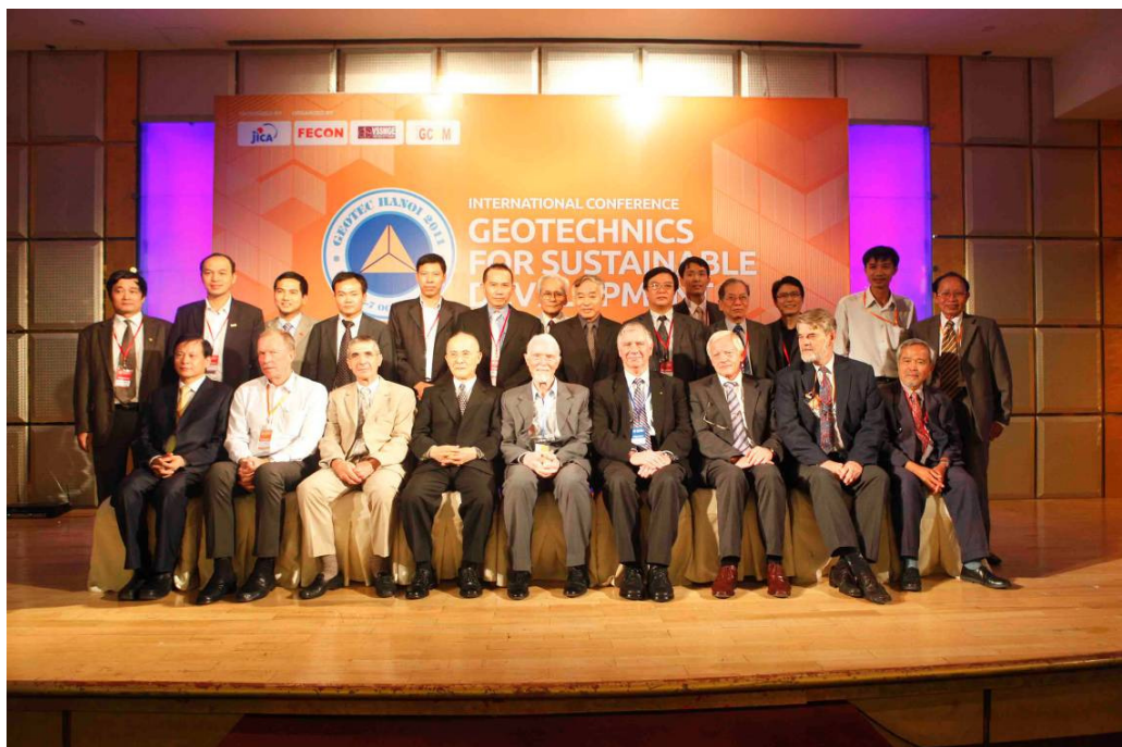
Figure 14. A memorable picture: conference organizers and special guests.