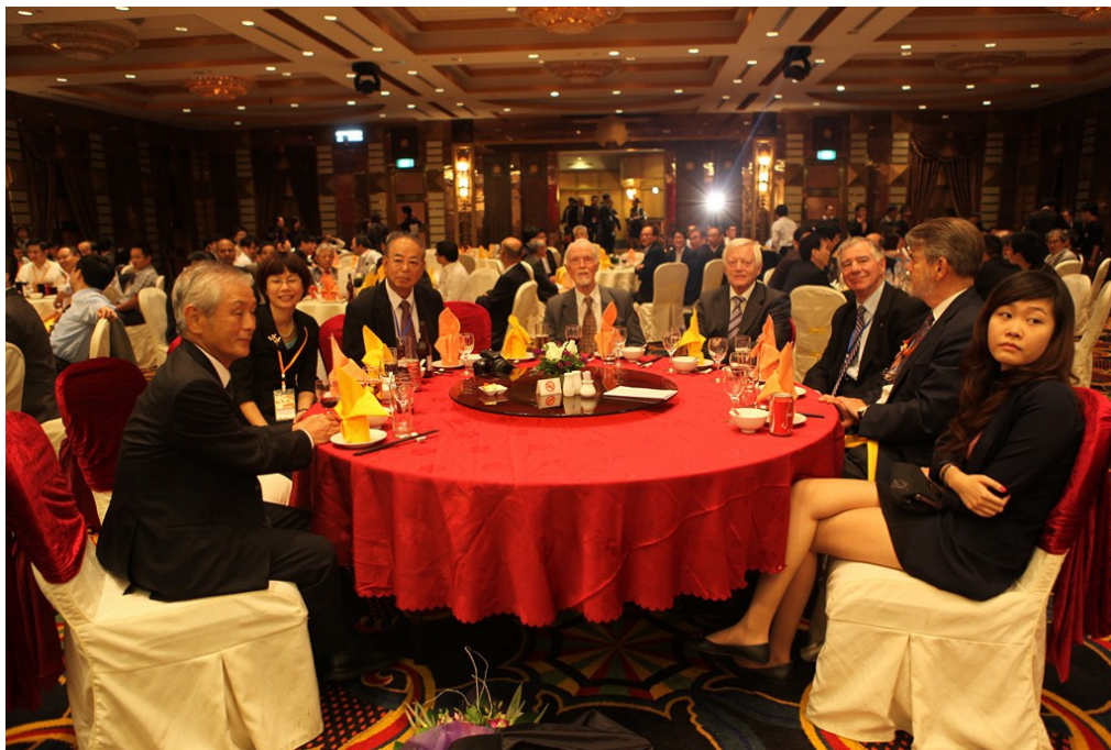
Figure 16. Gala dinner - Special guests.