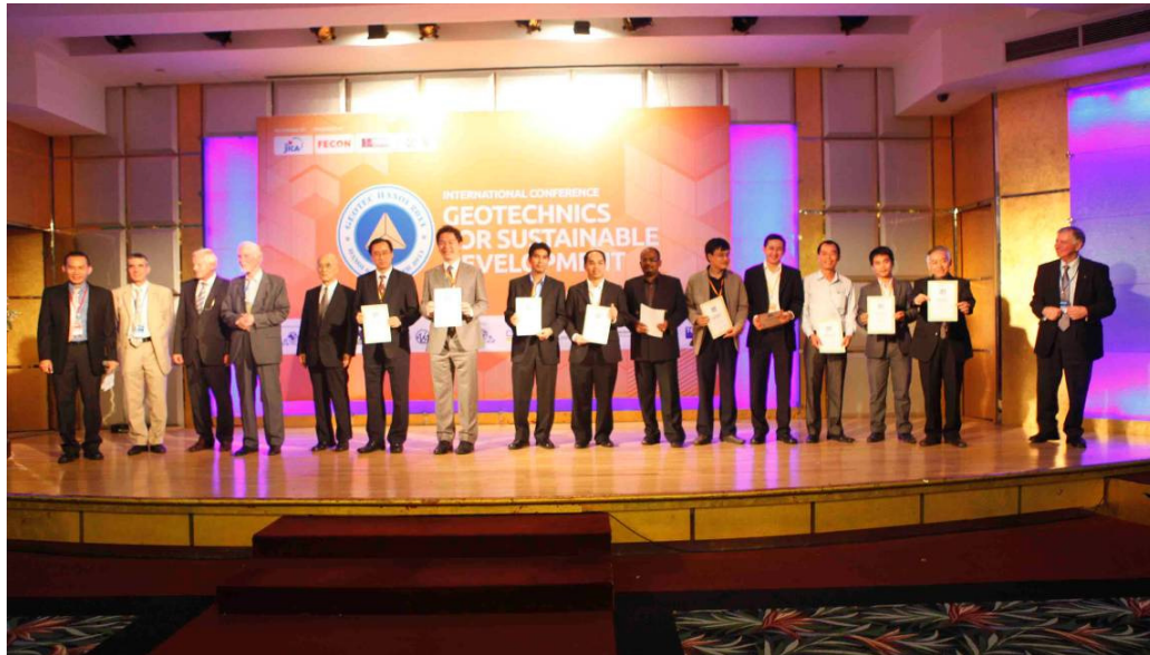
Figure 13. Handling attendance certificates to selected attendees.