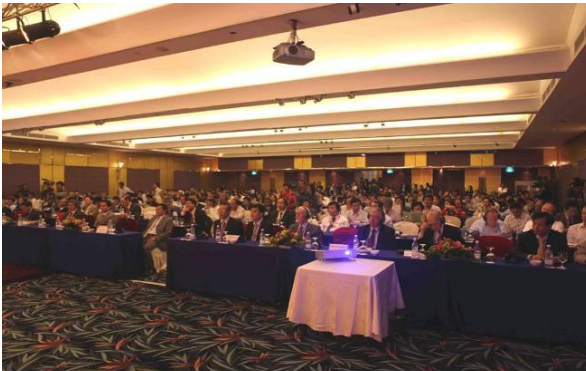
Figure 03. Part view of the audience.