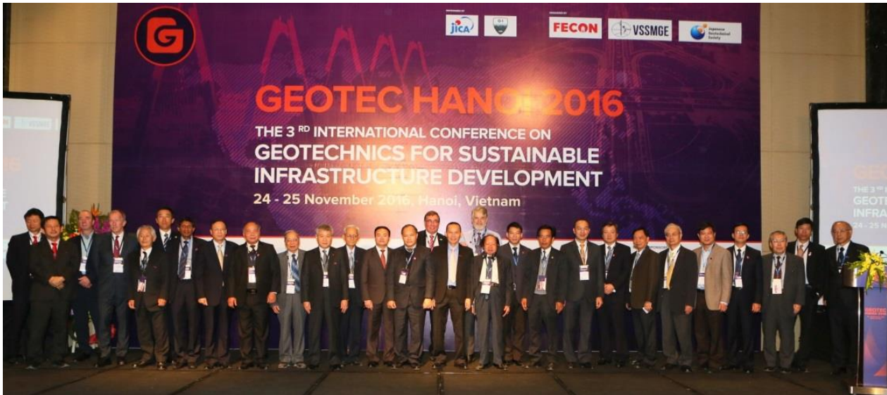
Photo 10. Conference's key persons

The 3 rd International Conference GEOTEC HANOI 2016, on Geotechnics for Sustainable Infrastructure Development, Hanoi, 24 th – 25 th Nov 2016 (Con't)