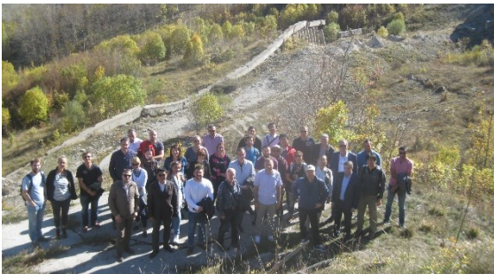
The symposium participants visiting „Čemerno“ landslide

The next day was reserved for the field study tour to massive landslides „Bogatići“ in Foča, „Čemerno“ in the Gacko municipality and „Sutjeska“ landslide and National Park in the southeastern part of Bosnia and Herzegovina. The field study tour ended with the lunch at the National Park „Sutjeska“.