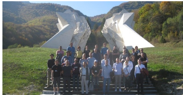
In front of monument erected to commemorate the World War II Battle of Sutjeska