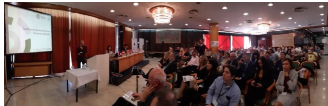
ReSyLAB & GEO-EXPO 2019 Symposium, Sarajevo, Bosnia and Herzegovina

The ReSyLAB & GEO-EXPO 2019 symposium was organized in two sessions - 4 th Regional Symposium on Landslides in the Adriatic-Balkan Region (ReSyLAB 2019) and 9 th Scientific and Expert Conference (GEO-EXPO 2019), with focus on the following topics: landslides in general, landslides mapping, geotechnical investigation and monitoring, environment engineering, underground structures, geotechnical hazard and risk, road infrastructure, foundations and landfills. The Symposium was held at the Hotel Holiday in Sarajevo, Bosnia and Herzegovina, from 23 rd to 25 th of October.