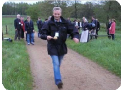
Everything under control at Frilandsmuseet (The Open Air Museum)