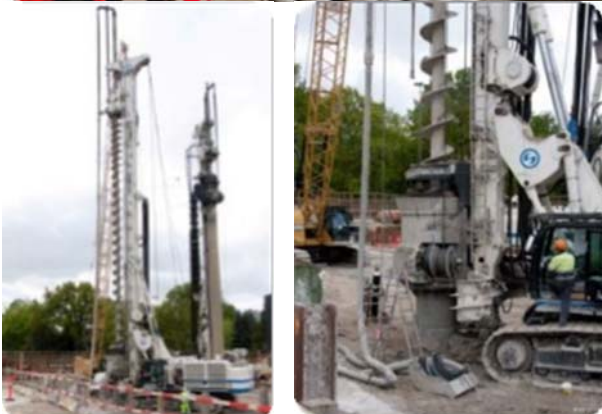
Technical visit at the Metro City Circle Line (Cityringen)