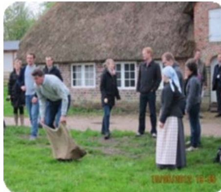
Moving quickly but carefully!