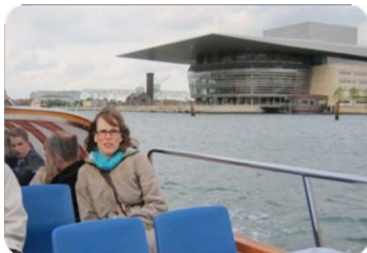
Sailing past the Opera House.