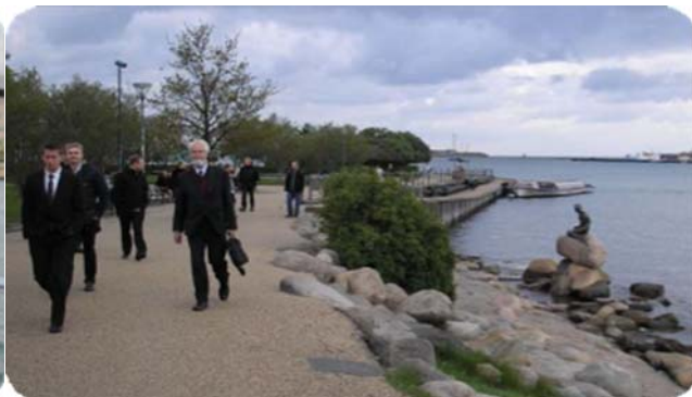
Walking past the Little Mermaid near Langelinie Pavilion.