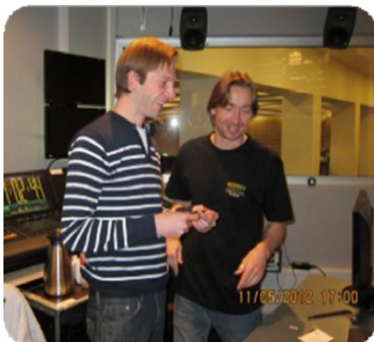
The two technicians at TCC