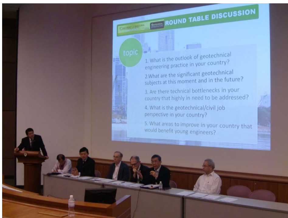
Roundtable discussion between the reputable mentors and the young delegates