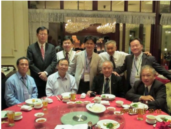
Organizing Committee Dinner