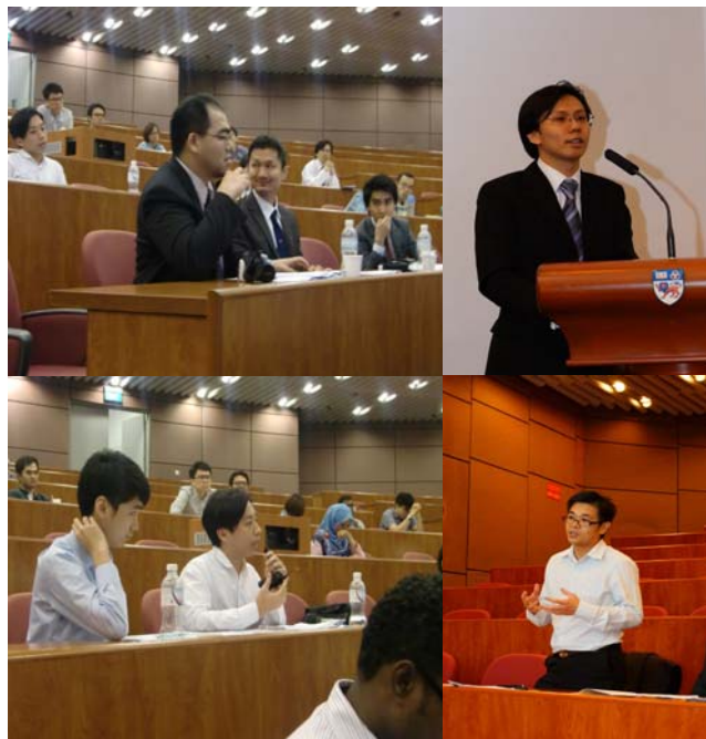
Our young and dynamic delegates