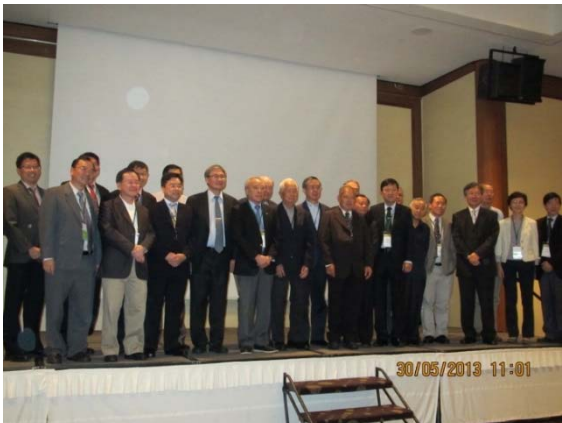
Group Photo of Organizing Committee with Council Members of SEAGS, AGSSEA and ISSMGE present at the Conference