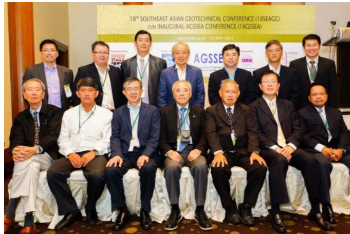
Photo taken after General Meeting of members of SEAGS