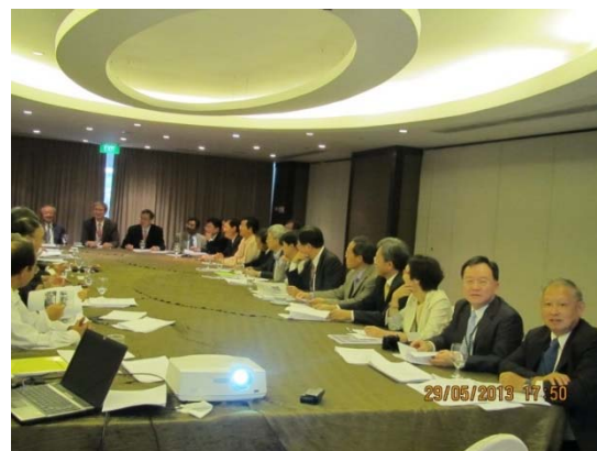
SEAGS & AGSSEA Council Meetings in progress