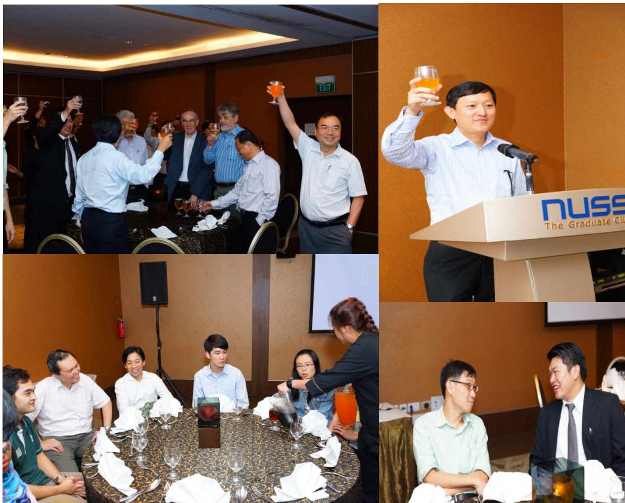
Friendship during the conference