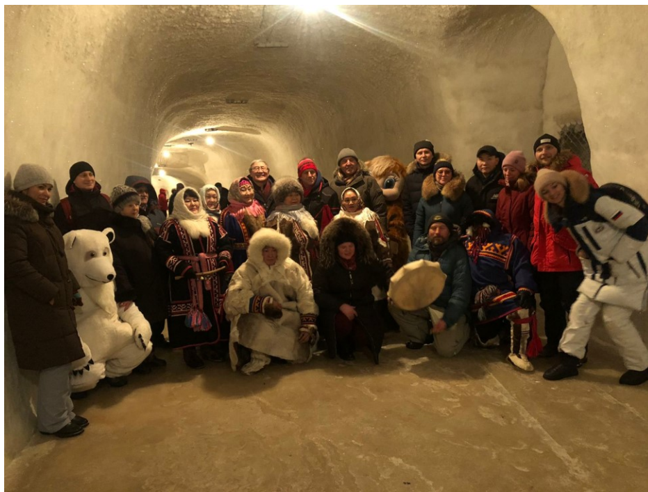
Photo 5. Group Photo from Technical tour in underground frozen structure