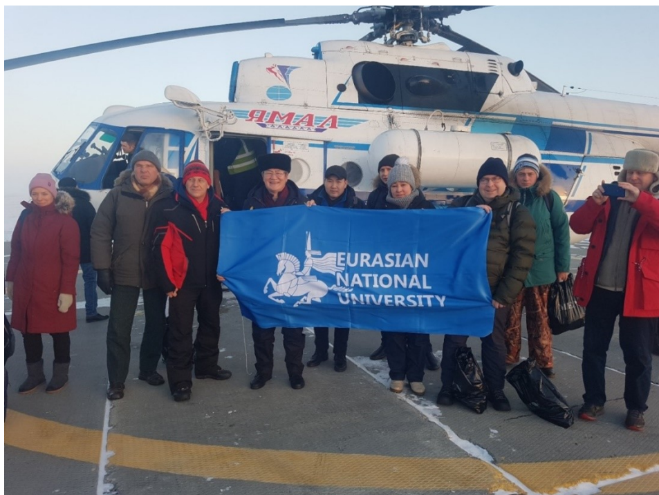
Photo 6. Group Photo after arrival to New Port (Arctic Zone) by Helicopter