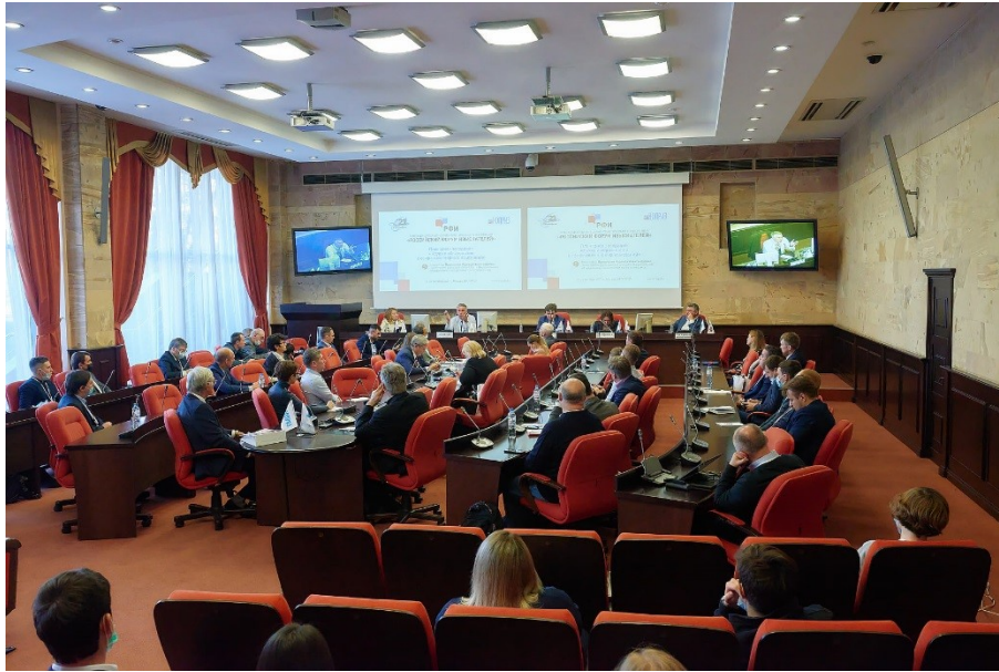
Photo 2. Plenary session