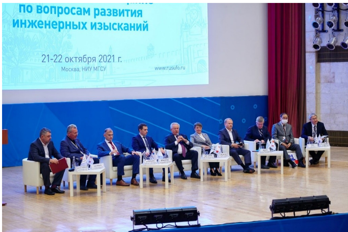
Photo 1. The opening ceremony