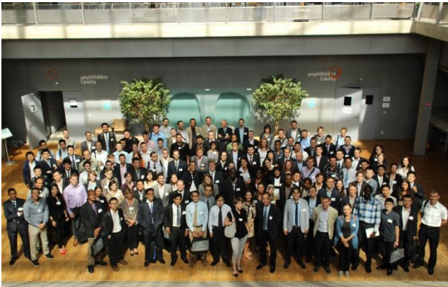
Members of Young International Geotechnical Engineering Conference (YIGEC) 2013 in Paris.