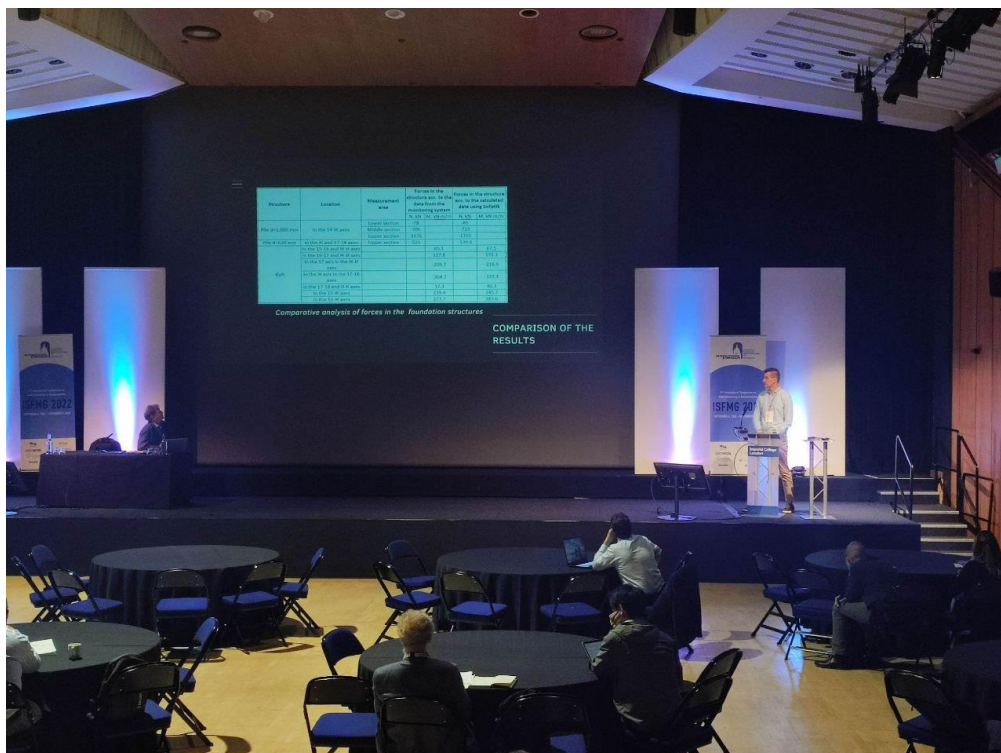
At the conference

I'm very exciting were on this symposium, because it gave me many new information about monitoring systems. I like that I have a many contacts with people, which are interested in monitoring. I like this symposium, because for me, as for student very important to take as many information as it possible from all of this smart people which has attend it. It very cool when after your presentation or presentation of another participation you can have a discussion with people which have many experience in building sphere. Symposium was made on a higher level and I will recommend all my colleague from Ukraine visit next Symposium which will be in India in 2026.