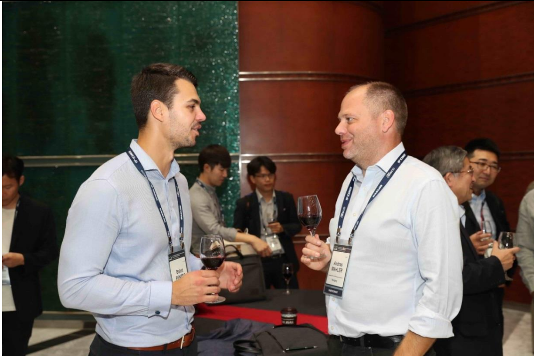
Discussion with an expert from COWI UK