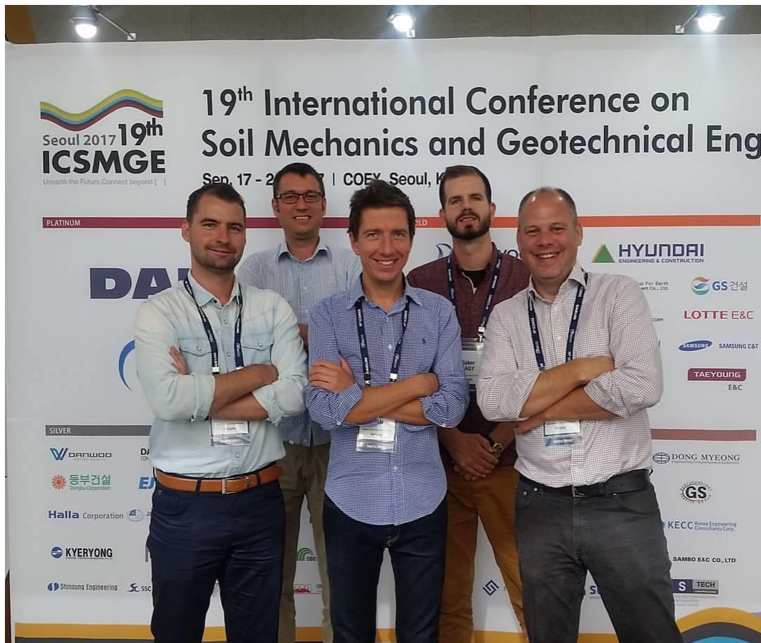
With the Hungarian colleagues