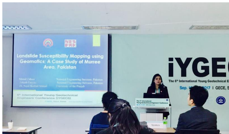
During my Presentation in iYGEC6 on Sept. 16, 2017, Seoul National University