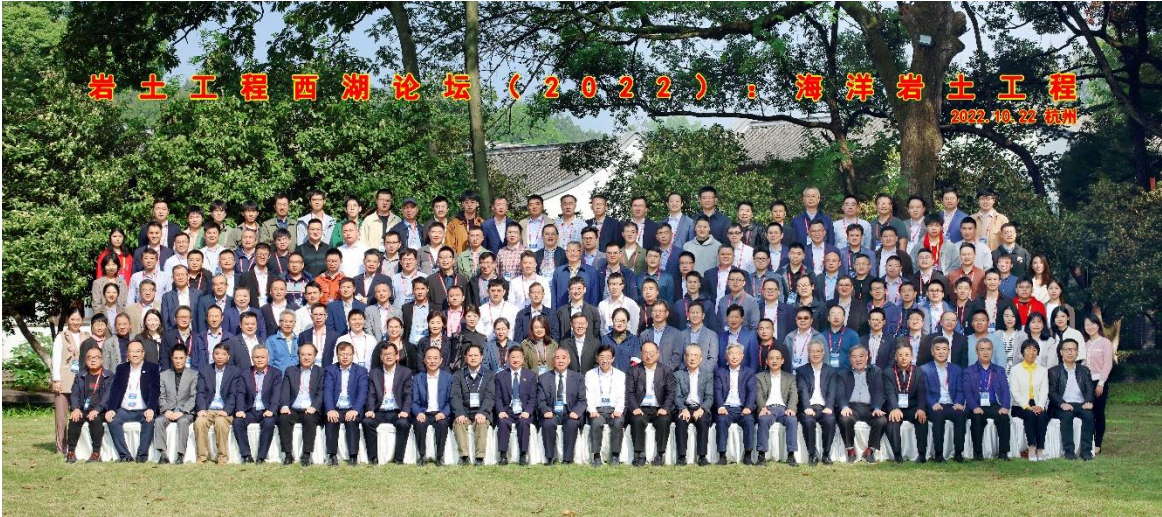
Plate 3: Xihu Forum for Geotechnical Engineering (2022) held in Hangzhou on October 22 2022. The theme of the forum was Offshore geotechnics. Over 200 participants joined the forum.