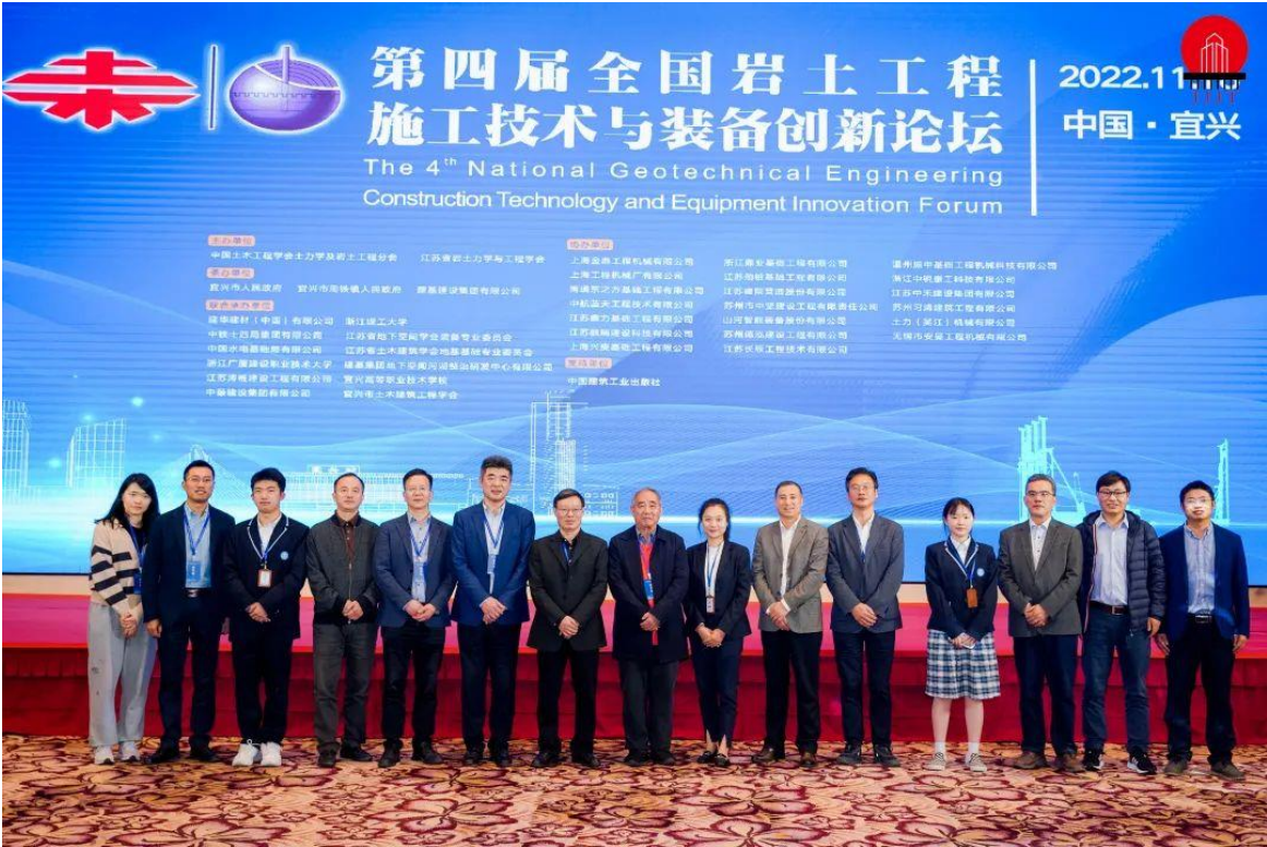
Plate 4: The 4th National Geotechnical Engineering Construction Technology and Equipment Innovation Forum held in Yixing on November 18 2022. The theme of the forum was Offshore geotechnics. Over 250 participants joined the forum in person and 50000 visited online.