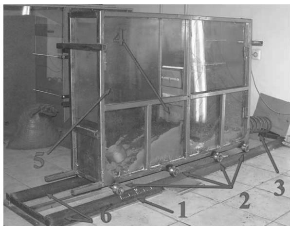
1- Scale of compression of a spring; 2 - Basic castors; 3 Spring; 4-Temporary partition in the middle of the stand; 5 - Transparent plexiglas; 6 - Directing rails.

anchors on increases stability of a slope many. Sensors of movements received values of horizontal and vertical deformations of a board of a ditch. Soil movements in natural state was much more movements of the slope fixed by soil anchors.