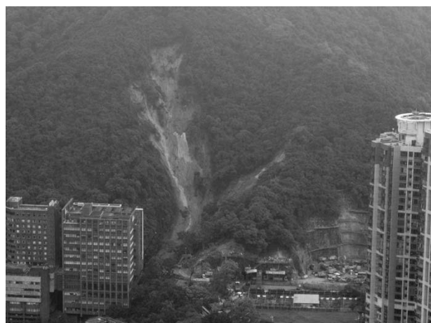
Figure 4: Landslide on the hillside behind the Hong Kong University

Comparing the June 2008 landslides with past landslide records revealed that the 2008 landslides seem to 'cluster' around old ones. Up to 92% of the 2008 landslides occurred within 50 m of at least one past landslide, and 80% within two or more past landslides (Wong 2009). Although further work is needed to interpret this phenomenon, this sheds light on the prediction of regions of natural terrain that is more prone to failure and has implications in the determination of natural hillsides that warrant priority for the mitigation of landslide hazards.