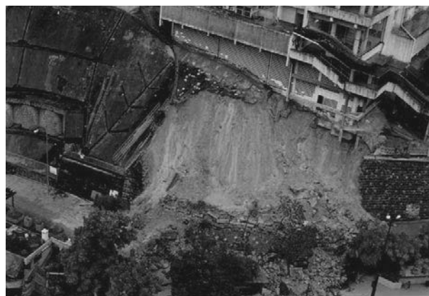
Figure 1: The Kwun Lung Lau Landslide in July 1994

On average, about 300 landslides are reported to the GEO each year. Most of these occurred at man-made slopes affecting buildings, roads or pedestrian walkways. Many landslides which occurred in remote areas or in natural terrain were not reported. Prior to mid-1990s, the GEO conducted LI on few selected cases of technical interest or having significant consequence. The occurrence of a number of fatal landslides in the mid-1990s has highlighted the need to further enhance the landslide risk management strategy in