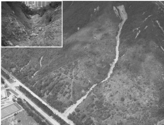
Figure 5: Yu Tung Road channelized debris flow

In general, the June 2008 landslide debris was found to be more mobile when compared with the previous historical natural terrain landslides in Hong Kong (Figure 6). About 20% of the June 2008 landslides have runout distances over 100 m, as compared with about 10% in past landslides that are observed from old aerial photographs.