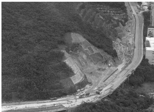
Figure 2: The Ching Cheung Road Landslide in 1997

Soil cut slopes formed or treated prior to 1990s typically involved trimming back to a less steep gradient without the provision of reinforcement or structural support. They are prone to degradation and vulnerable to the presence of local weaknesses in the groundmass. Large scale landslides involving such unsupported cut slopes are not uncommon. Notable examples are the Ching Cheung Road landslide in 1997 (Figure 2) and Shek Kip Mei failure in 1999 (Figure 3). The 1997 Ching Cheung Road landslide involved a failure volume of over 2,000 m 3 , resulting in the trapping of a motor car and temporary closure of a major route connecting east and west Kowloon for two months. The Shek Kip Mei failure involved a distressed volume of 6,000 m 3 , resulting in permanent evacuation of three housing blocks. Findings from investigation of such failures highlight the vulnerability of unsupported cut slopes to adverse geological features and hydrogeological conditions, which may be difficult to detect. A pragmatic approach of adopting more robust design solutions, such as the use of soil nailing was called for. A soil nailed slope tends to behave as an integral mass and is less sensitive to local adverse conditions as compared with an unsupported cut. The use of soil nailing has been widely adopted for upgrading of slopes in Hong Kong since mid 1990s.