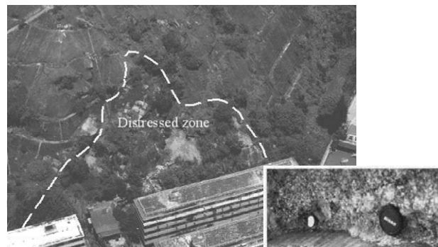
Figure 3: Laterally-persistent discontinuity infilled with slickensided kaolin and manganese oxide deposits at the 1999 Shek Kip Mei failure

(volume \geq 50 m 3 ). This indicates that the use of soil nails is effective in averting large scale failure. These minor failures were mostly involved surface erosion or minor local detachment in the groundmass between soil nail heads. Lessons learnt from investigation of soil-nailed slope failures have led to enhanced understanding of the behaviour of soil-nailed slopes (e.g. the importance of soil-nail head), improved detailing of surface drainage provisions (e.g. provision of intersecting drains for long sloping grounds), and enhanced surface protection details. Advances have also been made in the design of soil nails, as promulgated in the Geoguide 7 (GEO 2008).