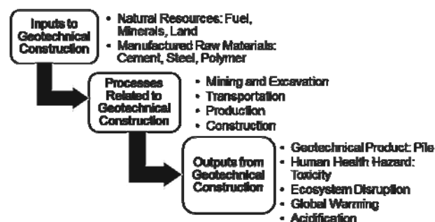
Figure 2. Flow chart showing the inputs, outputs, processes and impact categories in pile construction.

Misra and Basu (2011, 2012) recently developed a multicriteria based sustainability assessment framework for pile foundation projects. The framework considers a life-cycle view of the pile construction process (Figure 2), and combines resource consumption, environmental impact and socio-economic benefits of a pile-foundation project over its entire life span to develop a sustainability index (Figure 3). The use of resources is taken into account based on the embodied energy of the materials used, the impact of the process emissions is assessed using environmental impact assessment and the socio-economic impact of the project is assessed through a cost benefit analysis. Three indicators are derived from the three aspects and are combined through weights to calculate the sustainability index (SI) for the different alternatives available for the project (Figure 3).