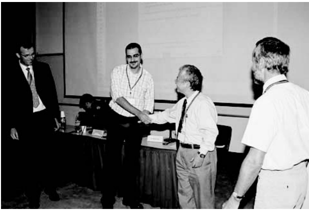
Figure 2. Presentation of the Schofield Award at the 6 th ICPMG