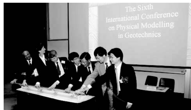
Figure 1. The opening ceremony of the 6 th ICPMG

Some delegates were delayed by the closure of Hong Kong Airport on the conference eve due to a typhoon. However, a full programme went ahead on day one after a small amount of re-shuffling. The dignitaries who presided over the opening of the event are shown 'switching on' the conference in Figure 1.