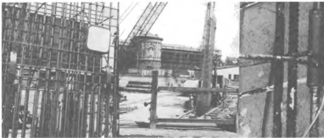
Figure 3. Measurements In-Situ - Geo-Brno-D