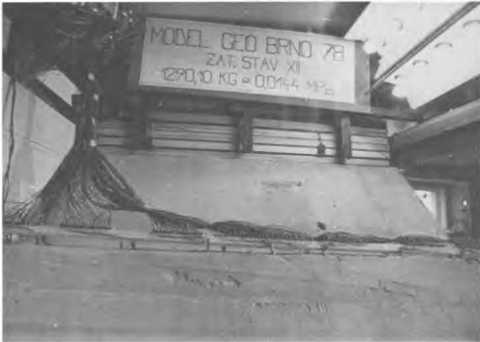
Figure 2. Physical Model Geo-Brno-78

sizes of the resulting stress (station of Cosmonauts - Prague subway). In the region of the fixed wall it behaves as a layer obeying the Winkler law (method of Winkler subgrade application by elastic springs for ideally elastic plastic matter). The rock is simulated by n - springs. The spring constants N_i are derived from the bedding coefficients K_i . It is presupposed, that the spring coefficients differ linearly, N being equal to the coefficients of the first spring, loaded on unit length which give rise to unit deflections. The distribution method has the advantage, that more accurate and more truthfull results of the internal wall forces are gained. The solution procedure is not difficult. The stated calculation was elaborated by the writer on the automatic computer (program under the title Geo-Brno-DM) in the calculation centre STÚ Prague, Rationalization and experimental laboratory.