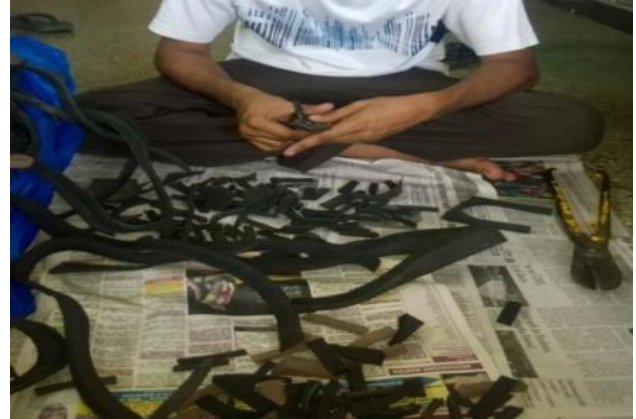
Fig. 3 Cutting rubber strips to required dimensions in lab.

the USEPA permissible limits. During experiments the leachate was passed through all test cols. separately. After 48 hours, the effluent from all test cols. were analyzed for various physico-chemical parameters. Percentage removal or reduction in various leachate parameters after passing through the test cols.