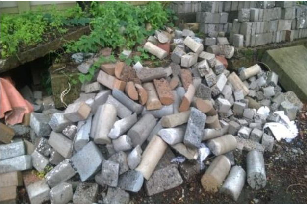
Fig. 1 Concrete waste source for recovery of aggregates

After 48 hours, the effluent leachate was collected through the outlet valve of test cols. and analyzed to determine various parameters such as those presented in Table 1 as per the Standard Methods (APHA,1980; APHA,1998).