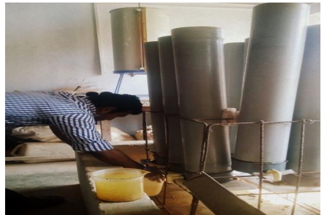
Fig. 4. Laboratory column studies setup.

were calculated using Eq.1, where l_p and l_t are physico-chemical parameters of raw leachate and treated leachate respectively.