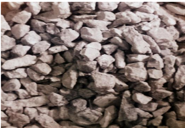
Fig. 2 Recycled aggregates from waste concrete source