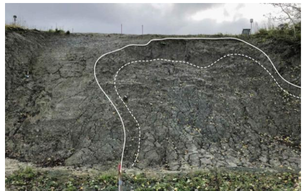
Figure 1. Picture of the slope after the failure

Over a monitoring period of several months, pore water pressure (PWP), soil temperature and soil moisture were recorded at various depth along the slope. Between late March and April 2020, a shallow failure occurred (Figure 1), although the exact timing is unknown. Several tension cracks were observed on the top of the slope and a large crown crack propagated from the top of the slope. Rainfall was recognized as the primary trigger for the failure. Nevertheless, even if minor, also the effect of freezing thawing cycles was reasonably not negligible: the cracks developed during the thawing season could have increased the permeability of the topsoil and consequently infiltrated water fluxes in April, raising PWP and reducing matric suctions (Shin et al., 2020). It is worth mentioning that the slope failure only developed in the bare portion of the site while the rest of the slope, where the natural vegetation was preserved, did not experience failure or soil displacements. Although rainfall appeared to trigger the slope failure, vegetation removal likely acted as a predisposing factor, making that portion of the slope more prone to failure.