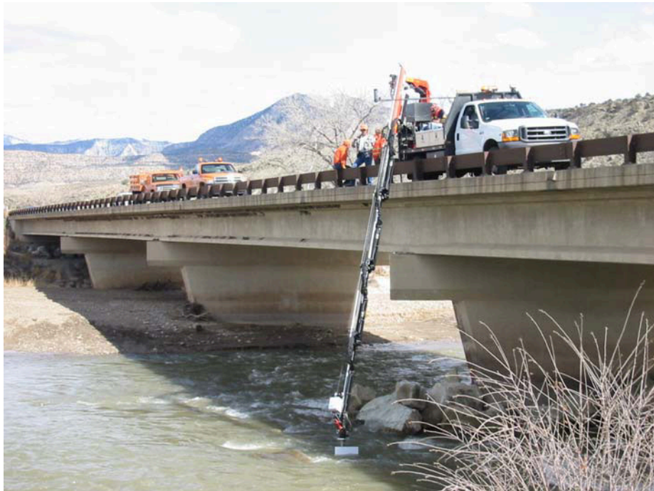
Figure 11. Truck mounted articulated arm with sonic transducer, fathometer, and computer.