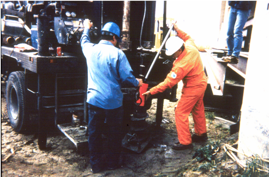
Figure 3. Hollow stem auger and installation of a float-out cylinder. (Lagasse et al, 2001)

Float-out Cylinder As a monitoring device, to protect scour susceptible bridges on ephemeral stream, a buried transmitter "float-out" device was developed for application on bridge piers (Price, 2002). This device consists of a 6 x by 11-inch cylinder with a radio transmitter buried in the channel bed at a pre-determined depth. When the scour reaches that depth, the float-out cylinder rises to the surface and begins transmitting a radio signal to a receiver in an instrument shelter on the bridge. The receiver transmits the information to a central location by telemetry. Normally by Landline or cell phone. The battery in the cylinder lasts 8 to 10 years. Installation requires using a conventional drill rig with a hollow stem auger (Figure 3). After the auger reaches the desired depth, the float out transmitter is dropped down the center of the auger. Substrate material refills the hole as the auger is withdrawn. Two cylinders are often placed in the auger hole. The first to alert that scour is approaching a problem and the second at the critical depth where action needs to be taken.