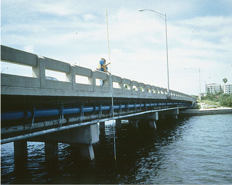
Figure 6. Sounding pole measurement.