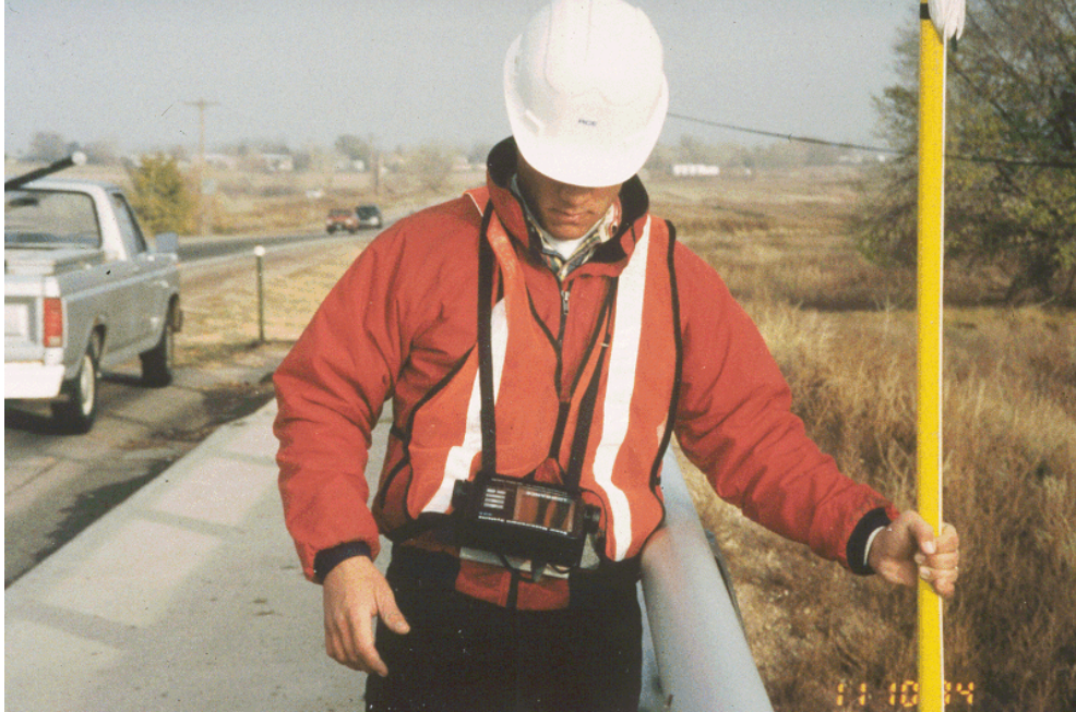
Figure 8. Portable sonar in use. Transducer on tip of rod.