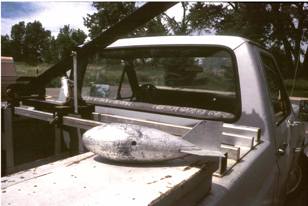
Figure 7. Lead-line sounding weight with truck mounted crane.