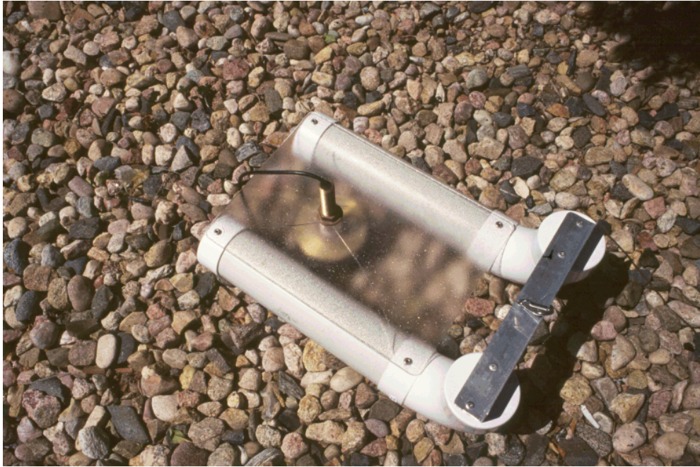
Figure 10. Pontoon float, note the transducer.