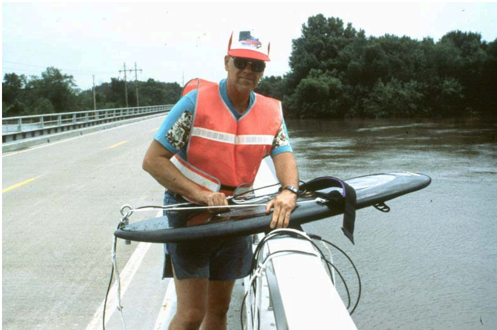
Figure 9. Kneeboard float with transducer.