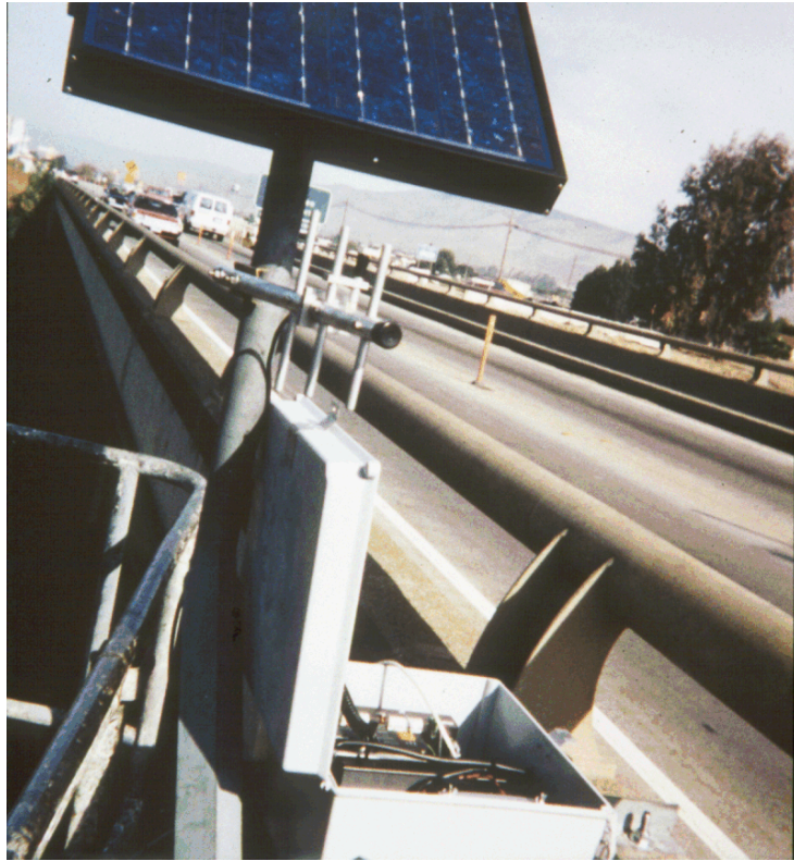
Figure 4. Typical instrument shelter with data logger, cell-phone telemetry, and a solar panel/gel-cell for power. (Lagasse et al, 2001)