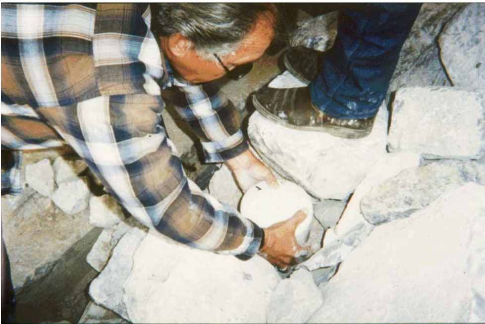
Figure 5. Installation of a float-out device to monitor riprap stability. (Lagasse et al, 2001)