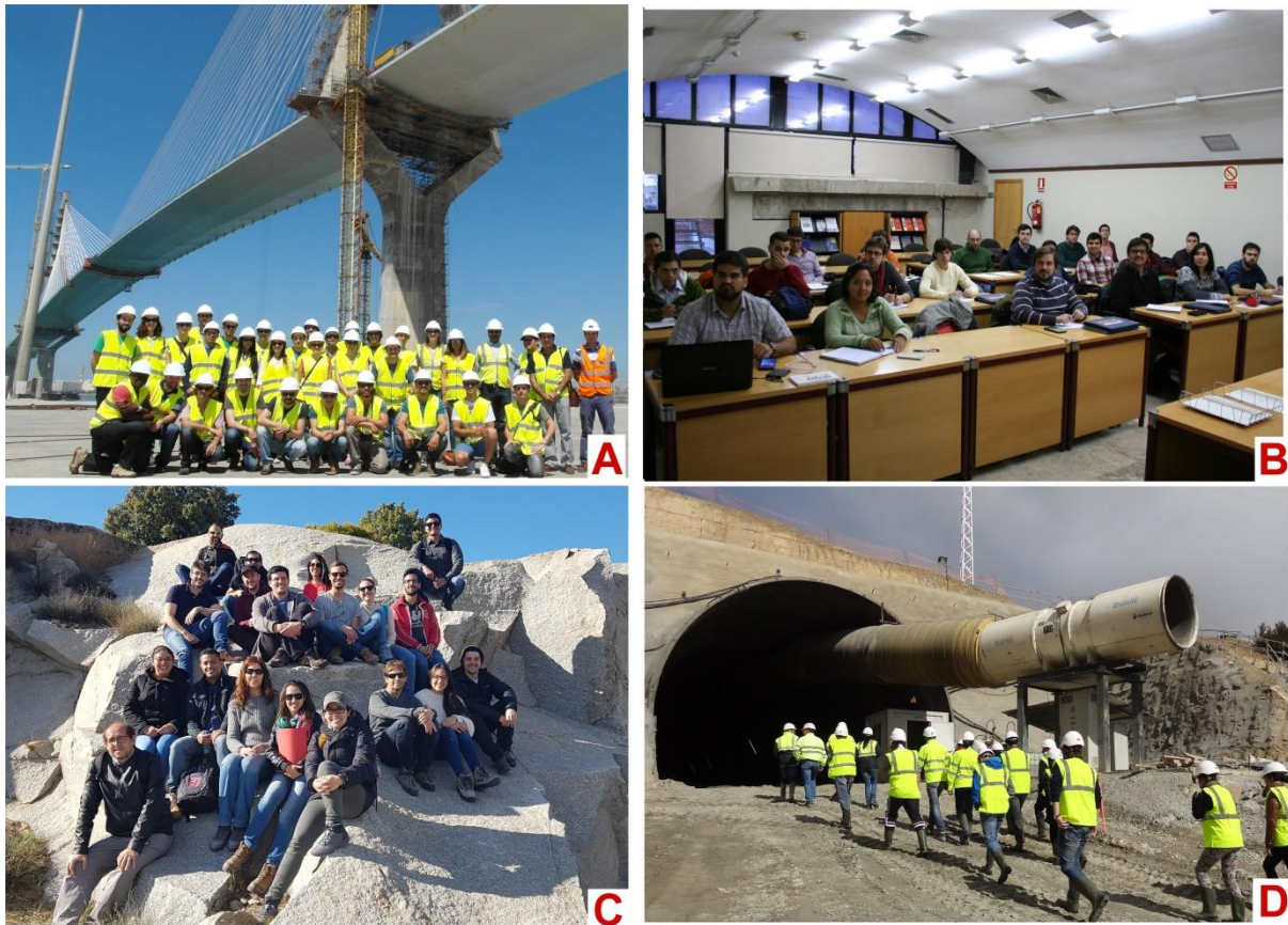
Figure 4. “A picture is worth a thousand words”; A) Bridge “Constitución” (Cádiz); B) in class; C) near the El Escorial Monastery, after the geomechanical survey; D) visiting a tunnel for the high-speed line in Galicia