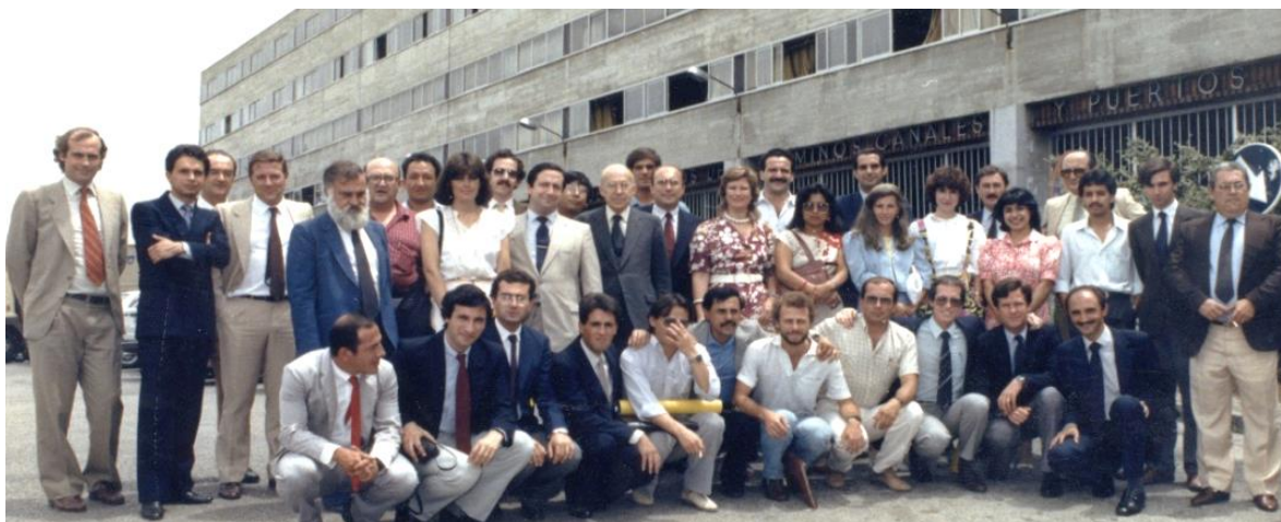
Figure 1. Students and coordinators of one of the first International Courses on Soil Mechanics and Foundation Engineering in the early 1980s right in front of the School of Civil Engineers of Madrid