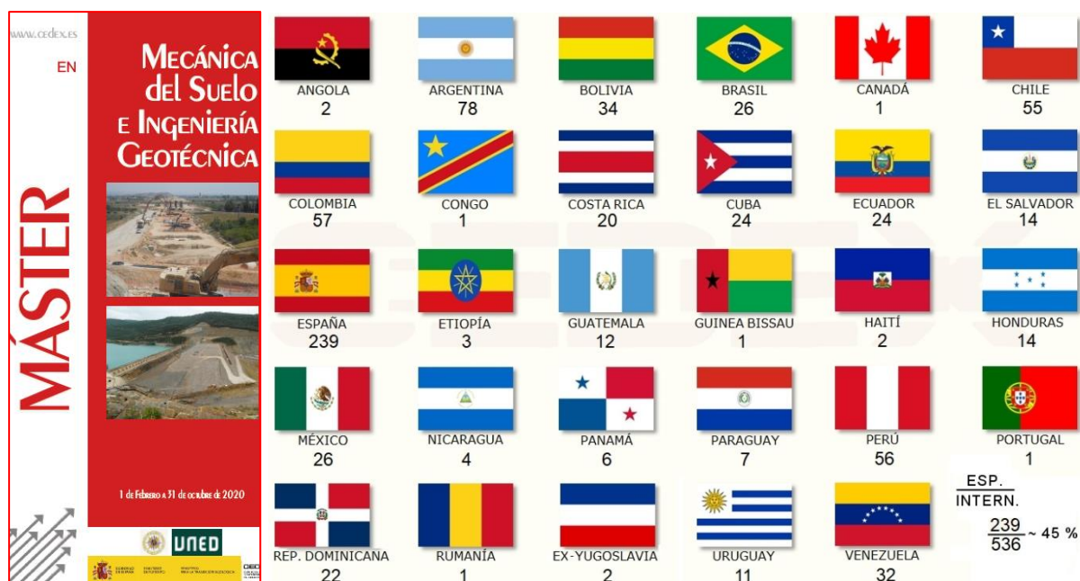
Figure 3. Flyer of the 2020 edition (38 th ), and of students' nationalities since 1988