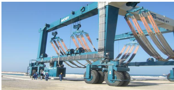
Figure 2. The Caspian Sea for more cargo shipments platforms construction site.

In this article loading tests used for deep drilling piles in Bautino near Aktau, Kazakhstan. Bored piles which have diameter 530 mm and 15 m depth have been executed at the Caspian Sea for more cargo shipments platforms construction site (see Figure 2). Some of the requirements of the designer of piled foundations and to what extent the accessible testing methods comply with these requirements are considered. Finally, some recommendations are made for testing methods suitable for problematical ground conditions of Kazakhstan are introduced (A.Zh. Zhussupbekov, M.K. Syrlybaev, R.E. Lukpanov, A.R. Omarov. 2015.) .