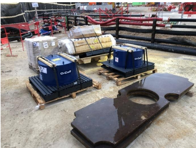
Figure 5. Instrumentation used for a designed 70 MN load test in a barrette (Fugro).

Figure 6, illustrates a typical test setup of a bi-directional loading test where the necessary reference beam was set over two concrete blocks. The final setup for a bi-directional pile load test may also require the use of short-term lifting equipment, it is important to notice that the same setup observed could be used in any test regardless of loading capacity, from 1 MN to over 300 MN. The test can also be performed offshore where the possibility of using top-down techniques becomes far more difficult, and substantially more expensive.