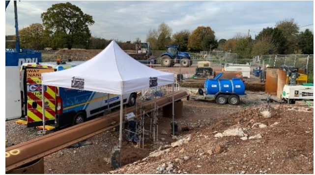
Figure 6. Bi-directional loading test underway (Fugro).