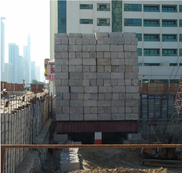
Figure 4. Loading test using kentledge Dubai (Fugro).

In comparison, it is possible to observe in Figure 5 the equipment necessary, including O-Cells ® and measuring equipment, for a bi-directional loading test designed to reach 70 MN. All the equipment was shipped via air to the closest airport and transported easily.