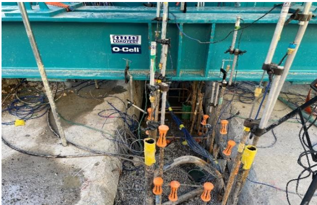
Figure 2. Bi-directional loading test on a pile with concrete cut-off level 12.3 m below ground level.

As an example of this, a project executed in Switzerland included the testing of three 2800x800 mm barrettes where the concrete cut-off level was left on average at 12.3 m below ground (Figure 2, shows the empty panel is backfilled with dry sand). The possibility of leaving the concrete level at the desired cut-off elevation allowed a saving of approximately 82.66 m 3 of concrete. Assuming the Carbon Factor of 212 kgCO 2 e/m 3 of CEM III/A GGBS (50%) based on the Inventory for Carbon and Energy (ICE) database, 17 TN of CO 2 were saved.