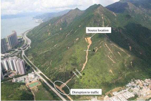
Figure 1. Yu Tung debris flow. The five sections indicate chainages (CH) where velocity estimates are available: A: CH100; B: CH413; C: CH439; D: CH462; E: CH477 (AECOM, 2012).

with a Voellmy rheology along the runout channel for both the Case1 and Case2. In particular, the change of rheology or values of rheological parameters between the source and the runout channel was necessary to simulate observed deposition of about 300 m 3 of debris within the landslide source area.