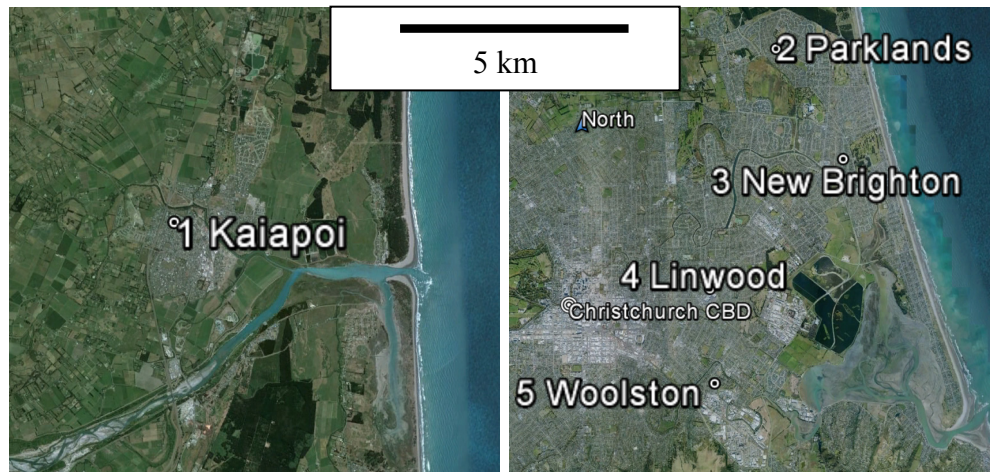
Figure 1. Site locations

performance. Data for the site selection were taken from the publicly available Canterbury Geotechnical Database (CGD). Sites were chosen only where mapped by the EQC as Technical Category 3 (TC3): “Liquefaction damage is possible in future large earthquakes”. Within TC3 zones, sites within close proximity to oceans or river tidal reach areas were preferred in order to assume that SLR translated to an equal increase in groundwater surface elevation. The sites were screened to include data only from cone penetration tests (CPTs) where the depth of exploration was greater than 10 m to maintain a relative degree of similarity in LSN among the sites. A general description for each site is presented in Table 3.