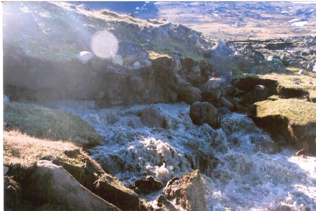
Photograph 2: Water Flowing from River Bank