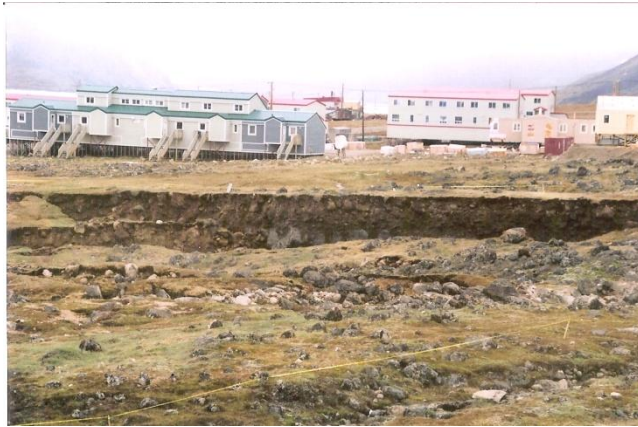
Photograph 1: Landslide Escarp