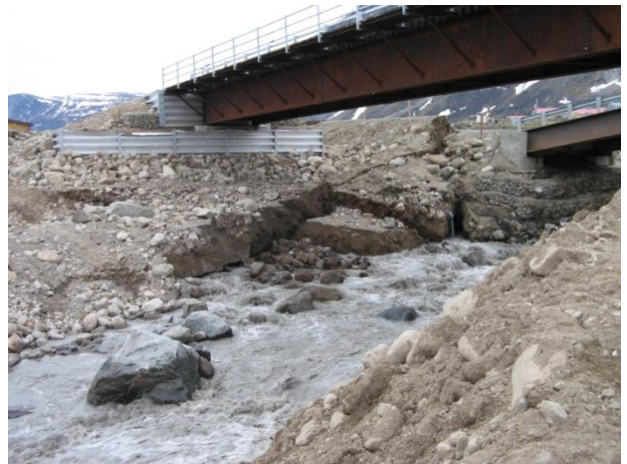
Photograph 5: Failure of North Bank

In general, abutment foundation soils were in an unfrozen state during the reconnaissance, and water was flowing out underside of the bridge abutments (Photograph 6), resulting in significant ground loss and lateral/vertical movements of the bridge substructures.