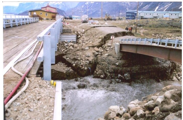
Photograph 4: Failure of North Approach Fill