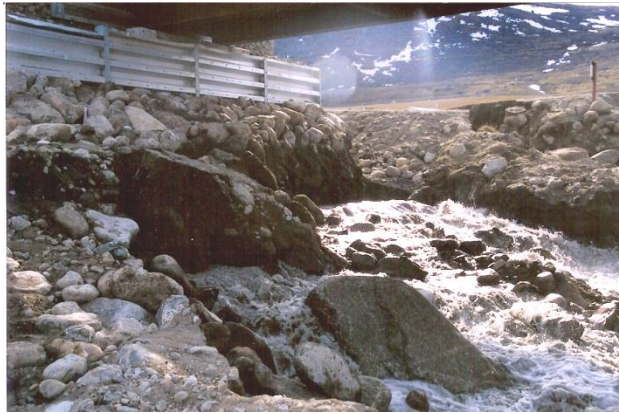
Photograph 6: Water Flowing Underside of Bridge Foundation

new bridge is 81 m with both abutments to be located on gentle terrace slopes beyond the river floodplain. Additional fill is required to bring the existing grade up to the designed bridge elevation.