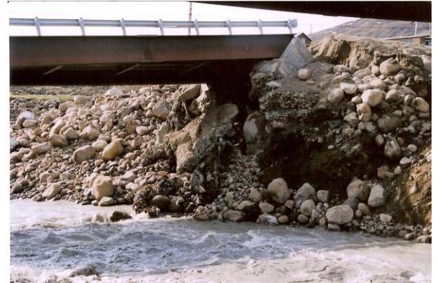
Photograph 3: Failure of South Abutment