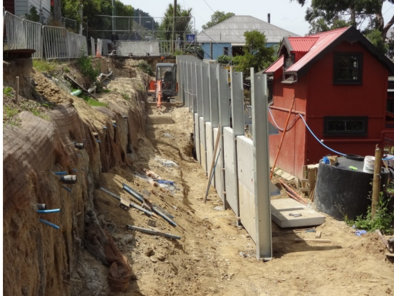
Figure 3. The partially constructed Cunningham Terrace retaining wall