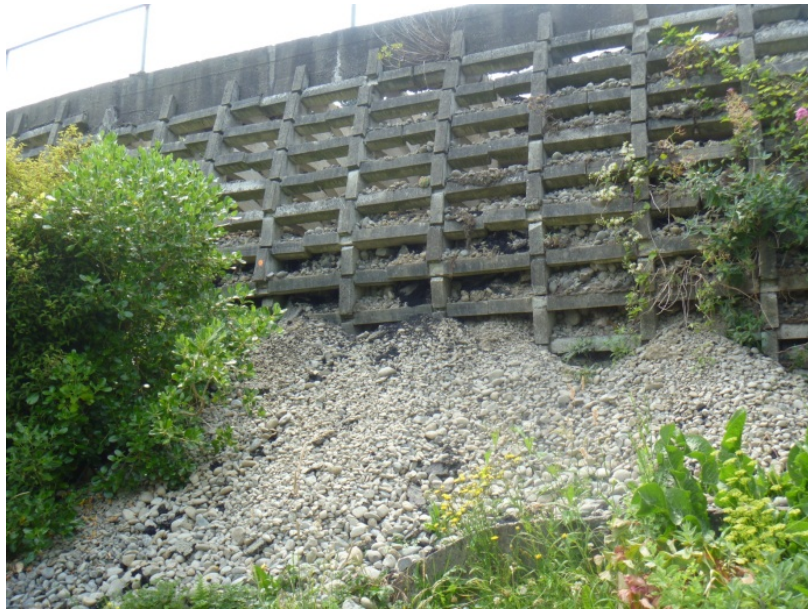
Figure 1. The damaged Cunningham Terrace retaining wall