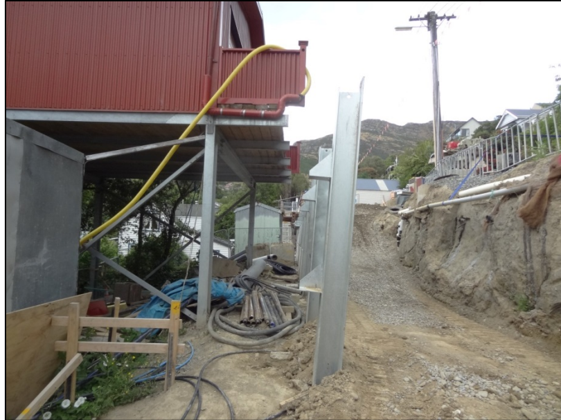
Figure 6. The gap created by the new wall alignment

The alignment of the top of the wall is slightly different to what was there before due to the reduced rake of the wall. There is a garage on stilts on the low side of the wall and the new wall alignment would result in a 0.5m gap between the garage and the road. This can be seen in Figure 6. To remedy this access had to be provided without relying on the private structure for support. Therefore a cantilever access was built from the top of the wall as part of the capping beam.