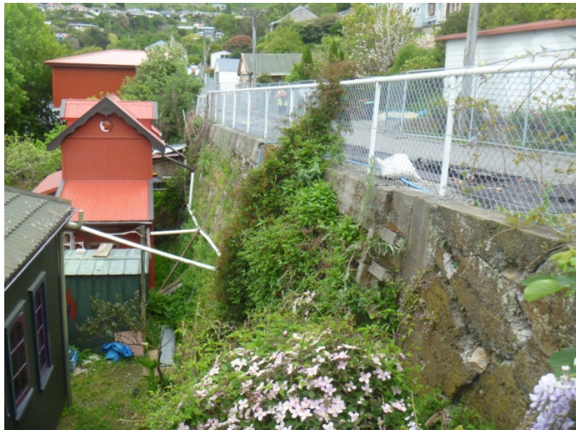
Figure 4. Cunningham Terrace retaining wall before demolition showing the confined site

One of the advantages of the system at SCIRT is the early contractor involvement (ECI). During design an ECI contractor is assigned to each project. For Cunningham Terrace this was Fulton Hogan. The design benefited from this involvement. For example the retaining wall panels were sized based on the maximum weight a particular piece of kit could lift. It was known that this was available for the works and could get access to the narrow site. In addition the anchor drill rig needed a certain width to operate in front of the excavated face. Benches at the base of the wall were designed to accommodate this and this ultimately determined the maximum height of the wall. The delivery team also had extensive anchoring experience and this knowledge was shared across the project.