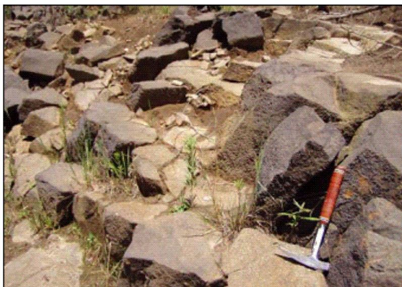
Figure 1: Dipping columnar joints are present on the margin of the crinanite complex along Cordeaux No.2 Dam Spillway. Columns in this area are approximately 25cm to 35cm in diameter, these are intersected by various later formed fracture sets.

Low angle, surface parallel exfoliation joints are present in most outcrop exposures (Figure 1). These are seen to cross cut primary fabric and early and late formed joint sets including the columnar joint sets.