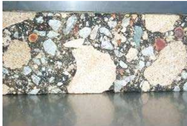
Figure 1. Example of a foamed bitumen beam section extracted from the pavement trial

A total of 193 beams have been tested, 166 beams comprising pavements of all crushed materials and 26 of pavements containing rounded particles. The results of the fatigue testing are shown in the chart in Figure 2 which is the results of fatigue testing of two sites at age 9 years.